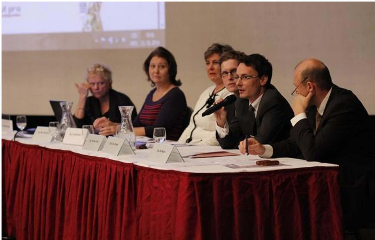
Picture 1: Panel of speakers. The VI. Forum 2014 Conference, 23.10.2014, Prague

The VI. Forum was held in Orea Hotel Pyramida, Prague on 23 th October 2014. This event focused on very wide scale of topics in its clear achievement - to support Regional Development in the Czech Republic. The event was organised by Bohemia EU Planners, Ltd. The organisation is a long-term supporter of the regional development and it leads and cooperates with the youth associations and groups in the field of volunteering. The company participates on number of educational programs granted by the European Union. Bohemia EU Planners Ltd. participates to the Erasmus programme for Young Entrepreneurs since 2010 and supports potential new entrepreneurs to develop their ideas and to cope with public administrations to set their own businesses. This conference was another part of the project Democratically Correct (DEMOTIC), which aims to examine and encourage the participation of young people in the field of volunteering and a political participation. It was the second public event organised by the Czech partner in this project. The VI. forum was held under the aegis of Ministry of Industry and Trade, Ministry for Regional Development, Ministry of Labour and Social Affairs and Ministry of Education, Youth and Sport.