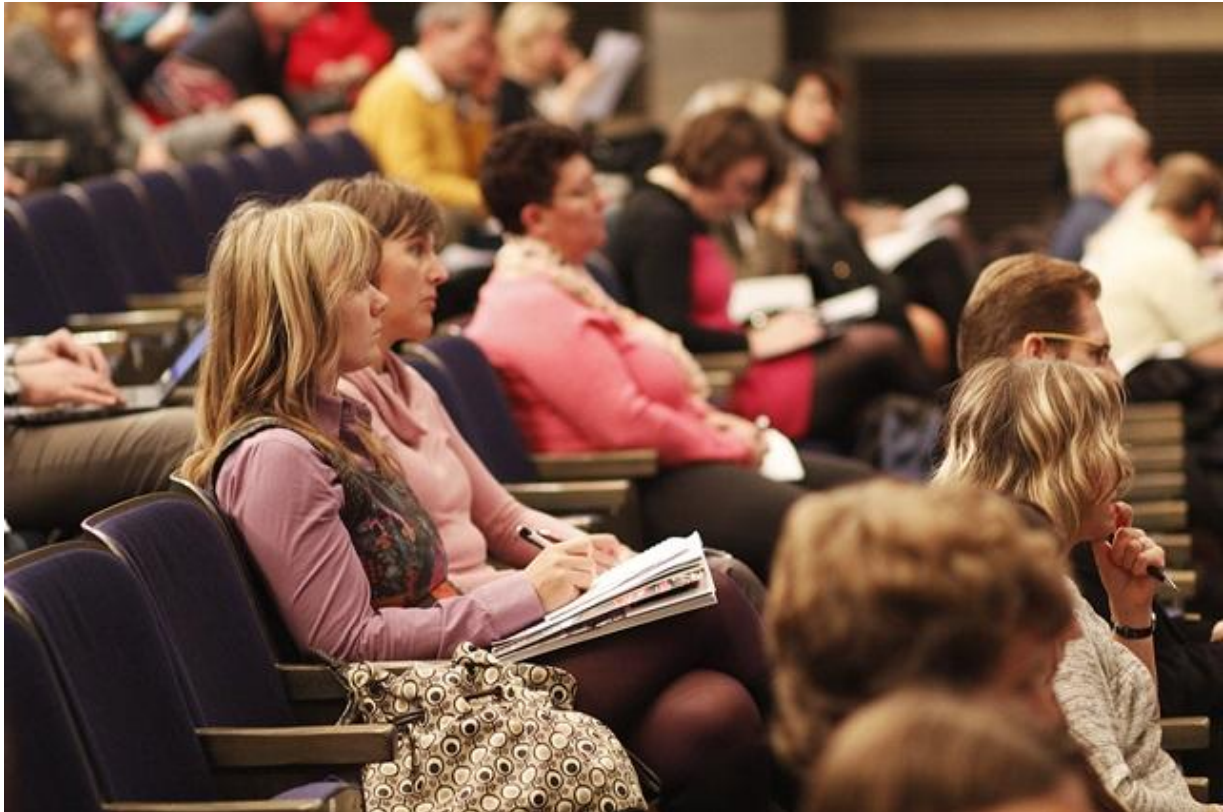
Picture 3: Participants. The VI. Forum 2014 Conference, 23.10.2014, Prague