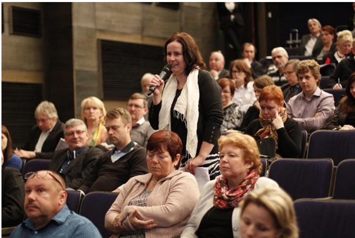
Picture 4: Questions & Answers section. The VI. Forum 2014 Conference, 23.10.2014, Prague

useful for young people to achieve their goals, because they also focused on success on the labour market. Next Forum, will take place in Prague in March 2015. There should be presented, inter alia, results of the Democratically Correct project. Scheduled end of this project is at the end of 2014.